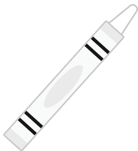
A white crayon

We can use water to make special art. We need: